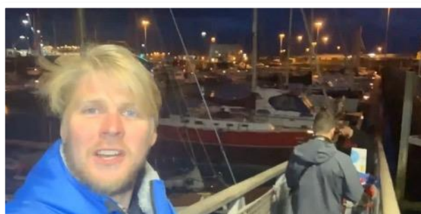
Explanation of the purpose of the AngelSwim and provisioning of the follow boat.