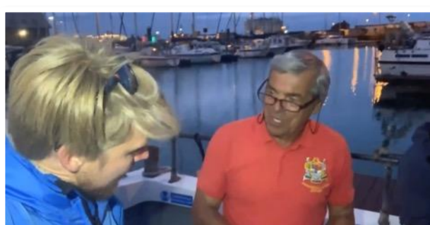
Going over the conditions with an official from the Channel Swimming Organization.